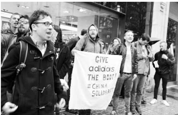
Solidarity with Chinese workers on strike.

Relocation compensation: The question of relocation is relevant because footwear factories in Guangdong province increasingly close down, laying off thousands of workers, as for example happened at Lide factory. Workers first heard about the relocation plans in 2014. We interviewed 13 Lide workers (10 women and 3 men). They were not officially informed; rather, the information was leaked. In reaction, workers went on strike from December 2014 to April 2015 to demand reasonable compensation. There were many international media reports about this strike, which was widely regarded as successful. Lide agreed to compensation, but tried to pay as little as possible. At the beginning, the company insisted upon paying compensation for no more than five years of work at the rate of EUR 68 per year. Not