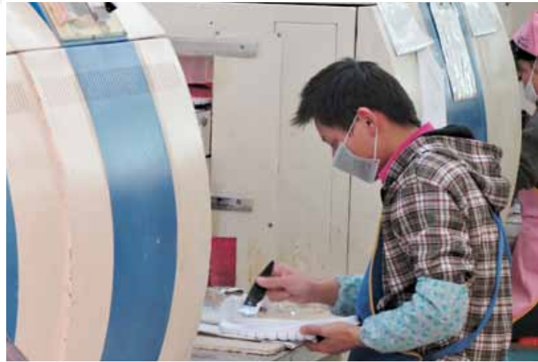
Health problems of workers in shoe production are often linked to the use of hazardous chemicals and inadequate protective clothing.

info@globalmon.org.hk · www.globalmon.org.hk