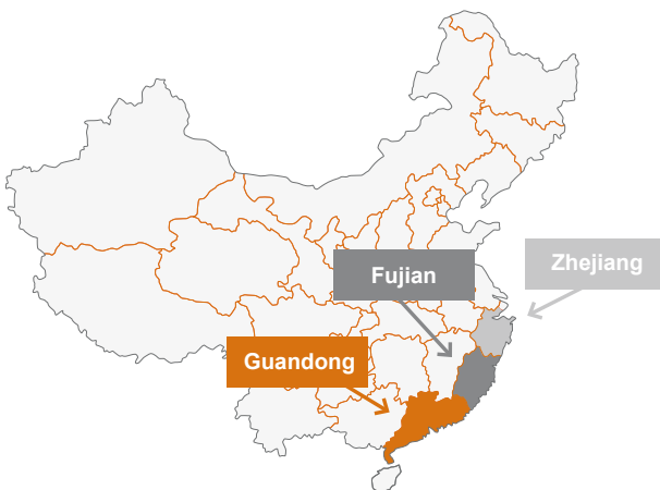
Fig. 2 China's Major Footwear Producing Provinces

The average age of our interviewees was 42; the youngest was 18 and the oldest 53 and 79 % were women. Some respondents mentioned that older people are increasingly being hired because the factories now have a hard time attracting young workers. We for example spoke with eight Yue Yuen factory workers who had been there only a few months at the time. Seven of them were between 40 and 50 years old. The average age of workers thus seems to be on the rise. That might explain why industrial action has increasingly focused on the issue of social security, in particular pensions.