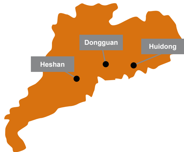
Fig. 3 The Major Footwear Producing Regions in Guangdong Province

Forced Labour: 25 (52 %) of those questioned stated that they were forced to work overtime. Punishments for refusing to do so included disciplinary warnings, the deduction of allowances, demotion and verbal abuse. Many stated that they depended on the money from additional hours and considered it a substantial part of their regular salary. For that reason, some interviewees did not feel like they were forced to do overtime, even when they were working more than 30 hours extra per month.