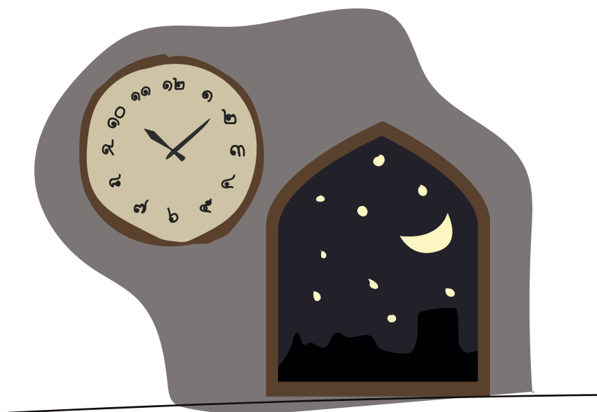
Illustration: © Annie Beckman

According to Thai labour law employees should have at least one paid day off per week. In the hotel sector, the employee and employer may agree to accumulate and postpone