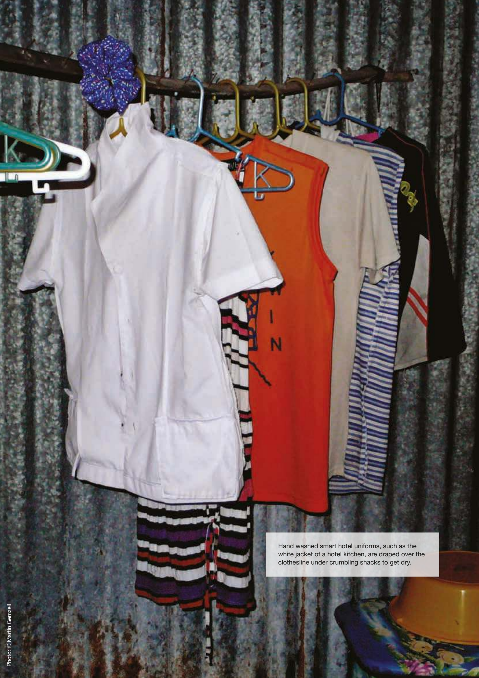
Hand washed smart hotel uniforms, such as the white jacket of a hotel kitchen, are draped over the clothesline under crumbling shacks to get dry.